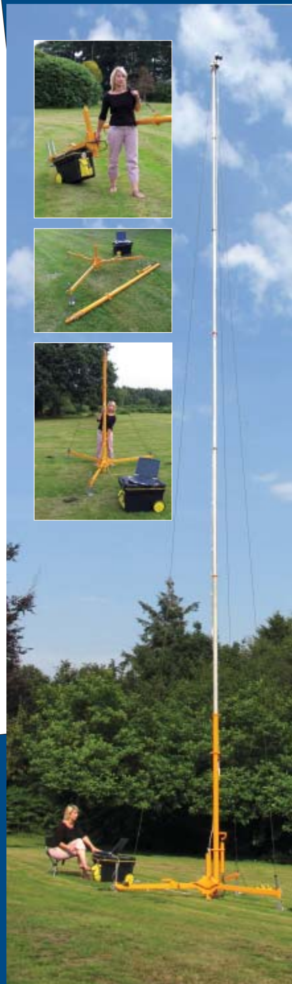
Set up time 6 minutes, height 53ft (15.2m)